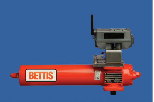
Bettis CBB with Wireless Transmitter